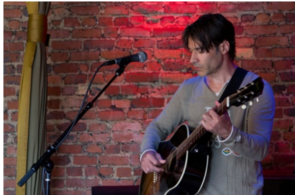
- Rockwood Music Hall, New York, NY