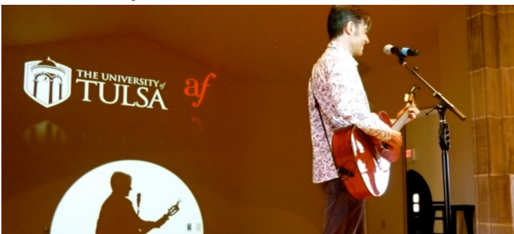
- l'Alliance Française, Tulsa, OK