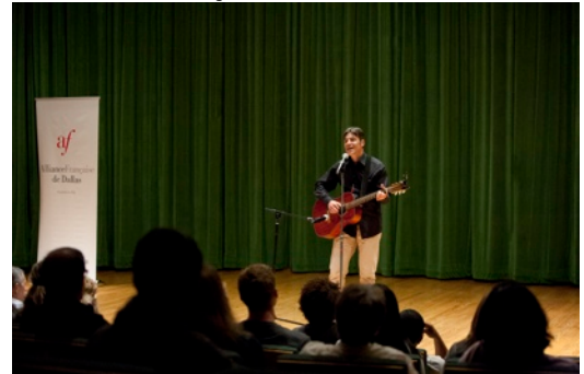
- Alliance Française, Dallas, TX