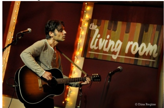
- The Living Room, New York, NY