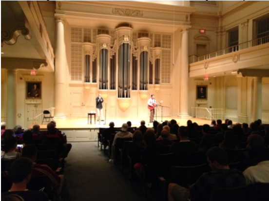
- Whitley Auditorium, Elon University Campus, NC