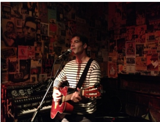
- The Station, Carrboro, NC